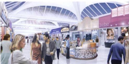
These changes will improve traffic flow by enhancing skylights between the buildings. Collapsing on the top level of the...

are underway with several home furnishings retailers, a high-growth category notably absent from the shopping centre's current merchandising mix.