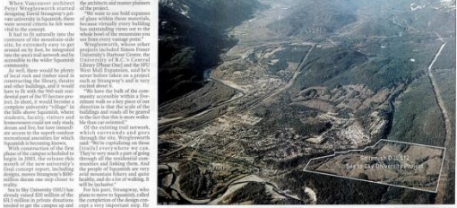
An aerial view of the site shows how the new university building will fit into the hillside and be pedestrian friendly.

It has to meld into the hillside and be pedestrian friendly. The new university building in Squamish must blend with the natural environment.