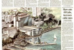
Shaw cuts 400 jobs, increases cable rates. Vancouver City Council has approved a major $1.1-billion project centered on what would be a 1.5-million-sq-ft office building...

TimberWest boss breaks softwood ranks. The U.S. what they want, executive says in radical departure from united Canadian stance.